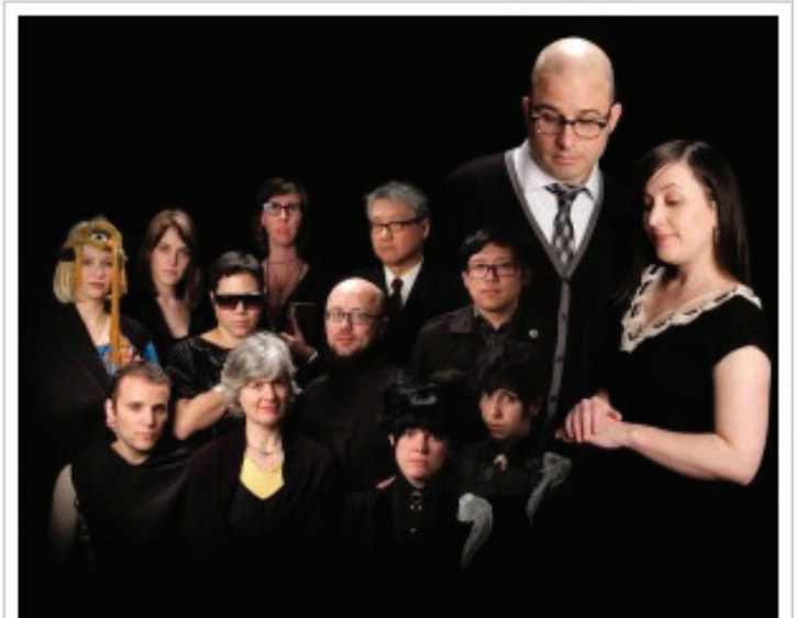
The Alliance of Pentaphilic Curators.