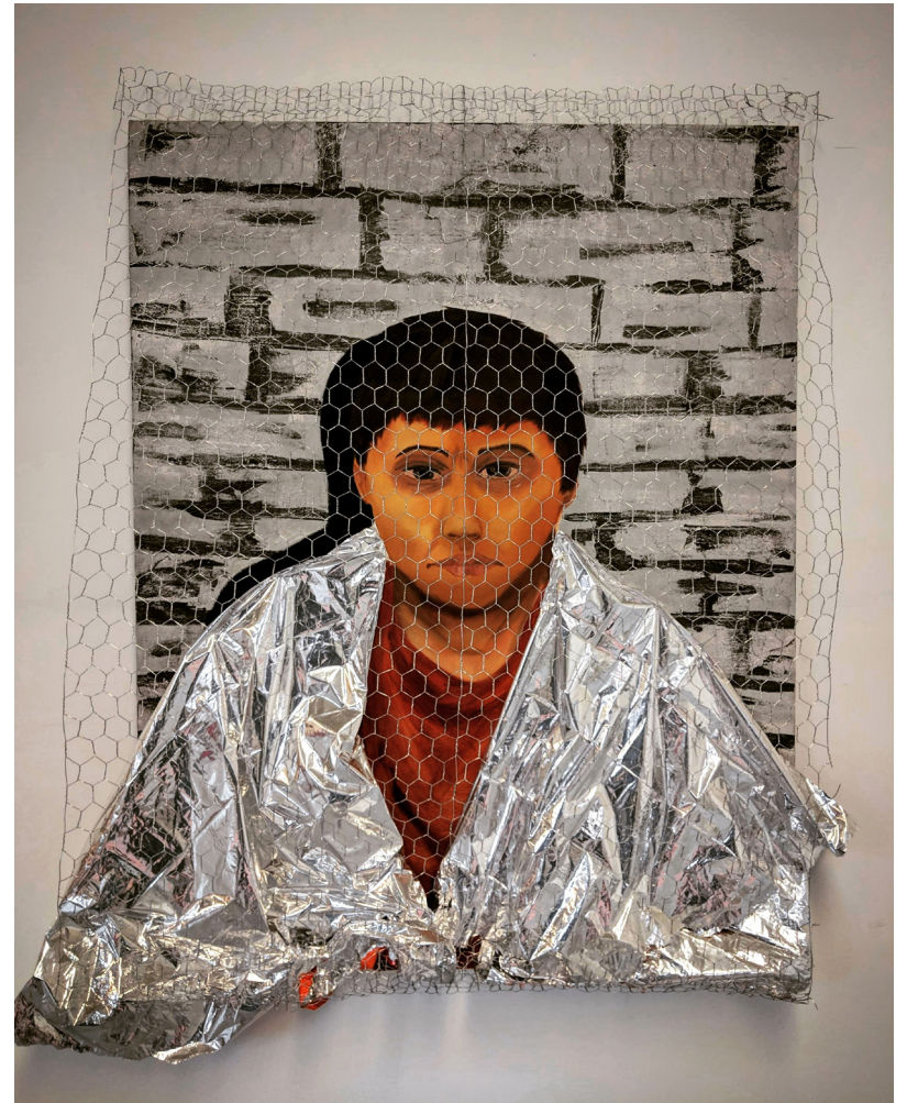
Brenda Nevarez, Los Niños , 2019. oil on canvas/thermal blanket/chicken wire, 35 x 45 in