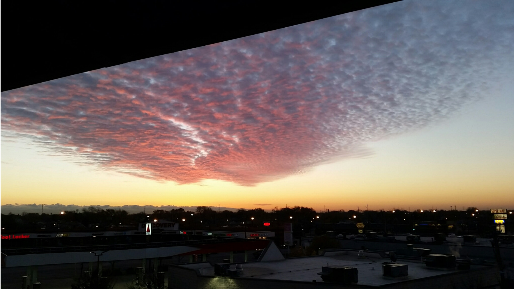
Susana Chenmei, Untitled , 2020