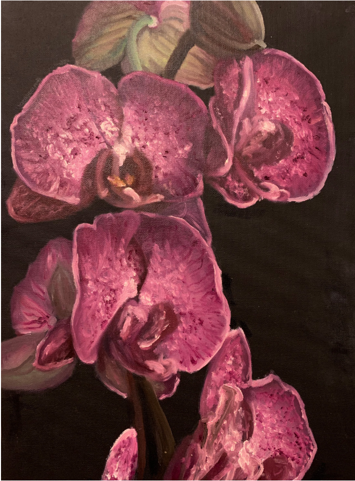
Deeva Evangelista, For Dad , 2020 Oil on canvas, 12 x 16 in