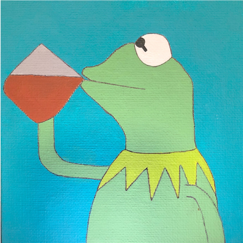
Alexandria Seballos, Sipping that Tea , 2020 Acrylic paint and sharpie on canvas, 5 x 5 in