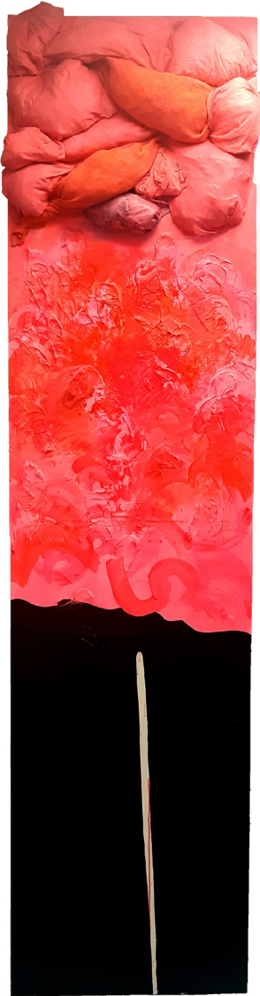
Sonya Bogdanova, Big Man , 2019. Acrylic, gel medium, canvas, muslin, and polyester on plywood, 2 x 8 ft