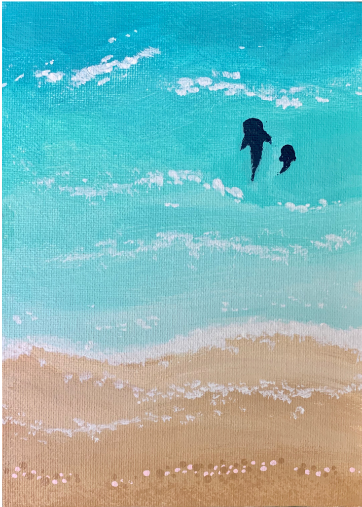
Clarissa Gomez, Pacific Haven , 2020. Acrylic on canvas, 5 x 7 in