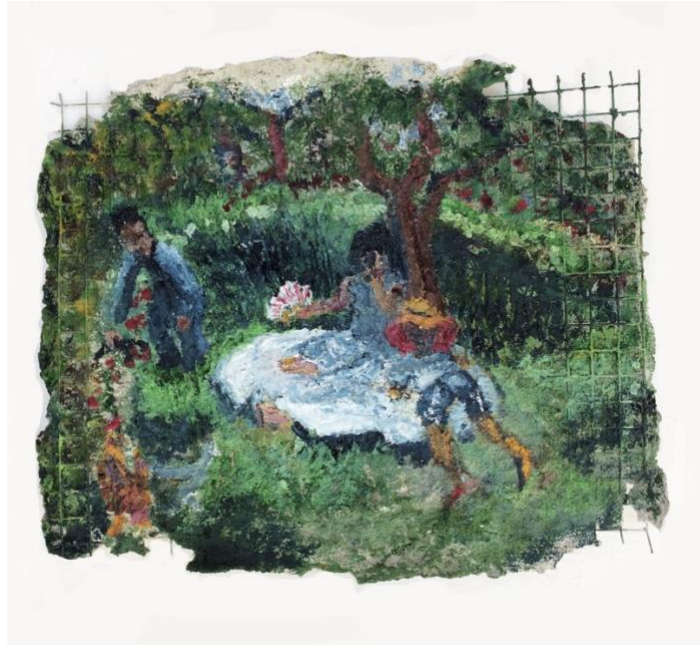
Jarett Key, Key Family in the Garden , 2019