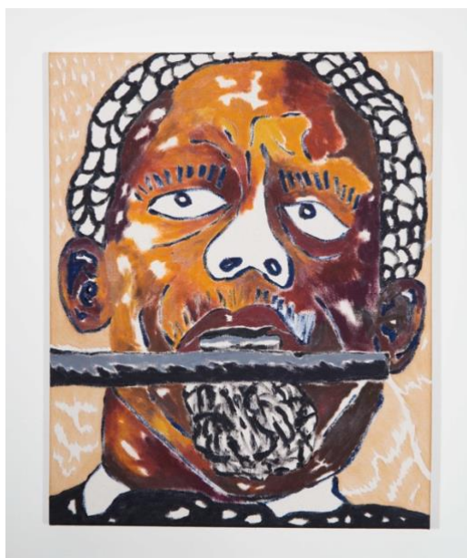
Chase Hall, Eric Dolphy , 2020

A Cutting-Edge Exhibition of Works by Black Artists that Brims with Renewed Urgency On View at Gallery 400, University of Illinois Chicago from September 2-December 11, 2021